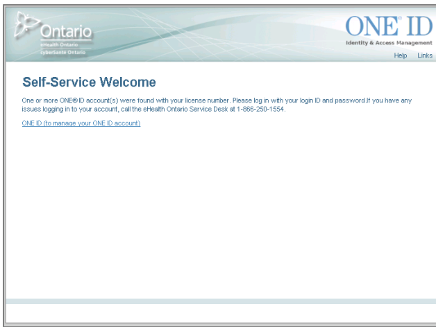
Figure 1.1 – Self-Service Welcome Page

The ONE ID CPSO Self-Registration Module is for new ONE ID registrations only; existing members should continue using their ONE ID credentials to access digital health services. In the event you try to create a new account you will be redirected to the Self-Service Welcome page. From here, you will be given the option to go directly to ONE ID and enter your credentials to login.