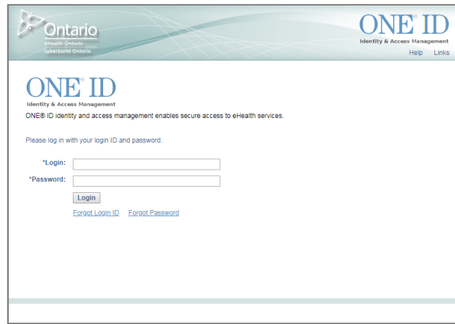
Figure 1.2 – ONE ID Login Page

Note: If you have forgotten your account information, you may use the “Forgot Login ID” or “Forgot Password” processes to recover your credential; refer to the ONE® ID Registrant Reference Guide for more details.